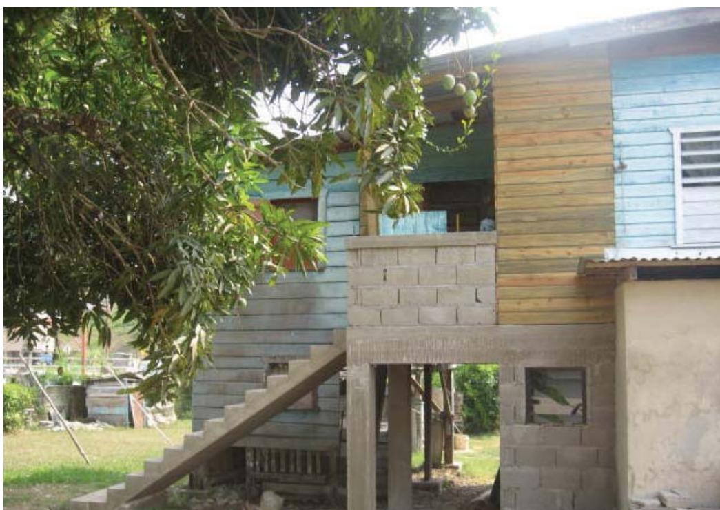
Fig.4 Home Improvement- Georgeville- Back porch w/steps