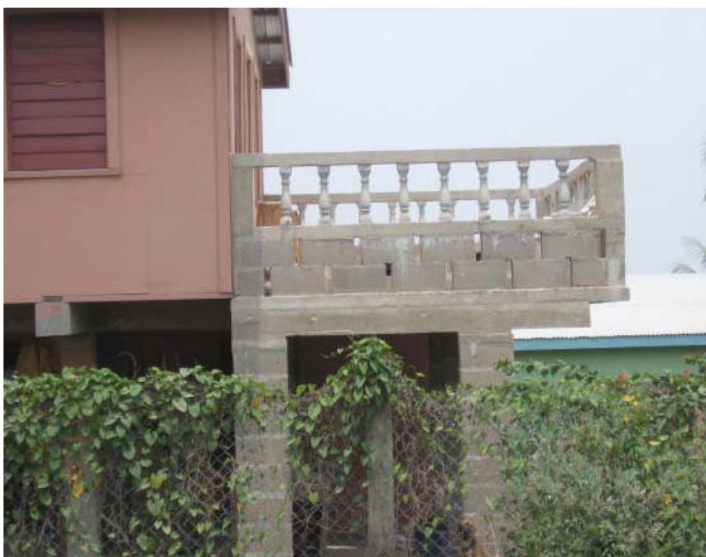
Fig.5 Home Improvement- 18 th Street, San Ignacio Town- Back porch