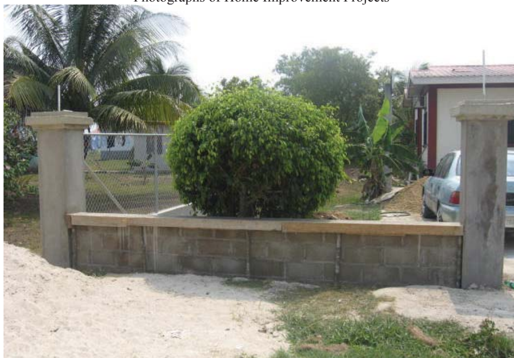
Fig.1 Home Improvement- Caladium Street, Belmopan- Fencing