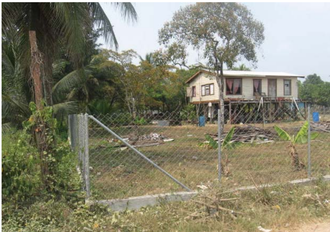
Fig.6 Home Improvement- Cotton Tree Village- Chain Link Fence (left angle)