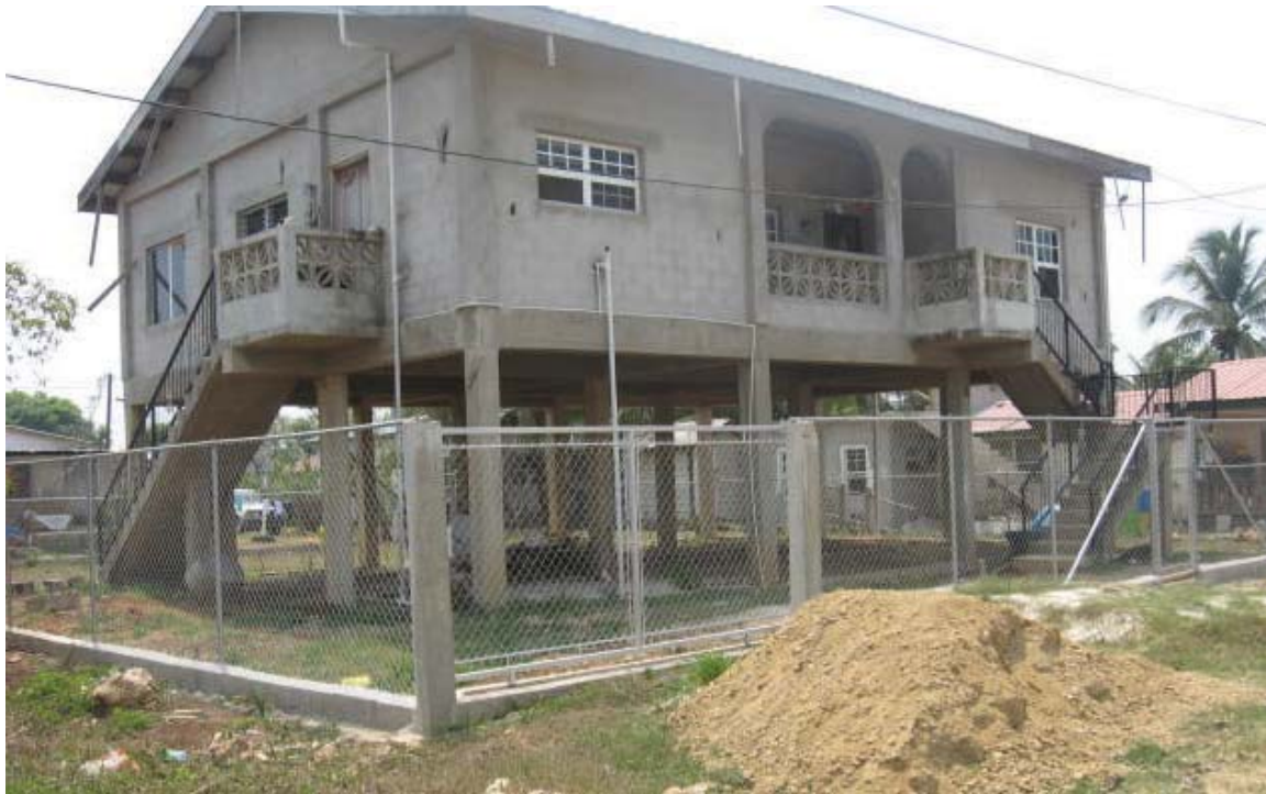
Fig. 2 Home Improvement- Pineapple Street, Belmopan- Fencing