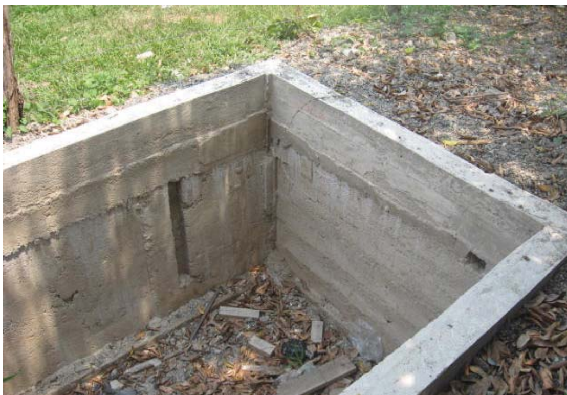
Fig.7- Home Improvement- Guadalupe Street, San Ignacio Town- construction of septic tank