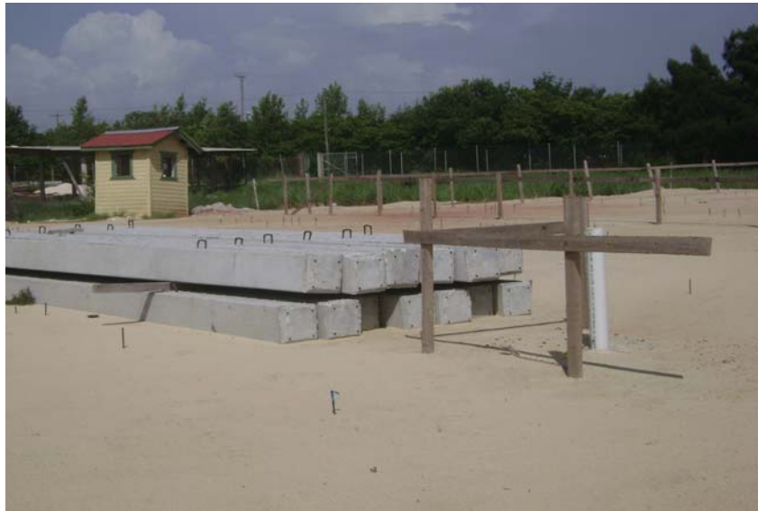
Figure 1 (Marion Jones Stadium)