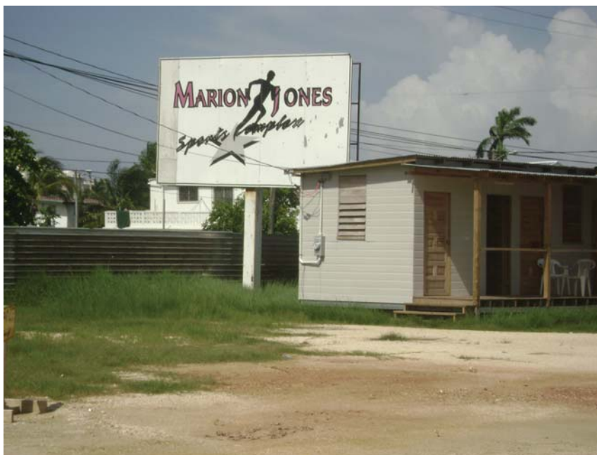
Figure 3 (Marion Jones Stadium)