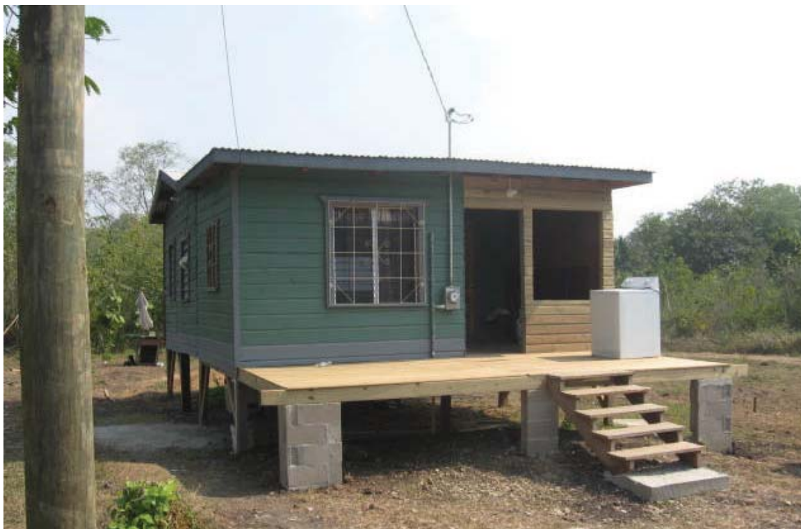
Fig.3 Home Improvement- Roaring Creek, Cayo District- repairs to front part of house & steps.